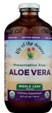
Lily of the Desert Organic Aloe Vera Juice