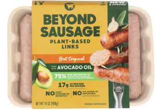
Beyond Meat Beyond Sausage