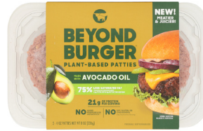
Beyond Meat Beyond Burger

At Beyond Meat, we believe there is a better way to feed our future and that the positive choices we all make, no matter how small, can have a great impact on our personal health and the health of our planet. By shifting from animal to plant-based meat, we can positively impact four growing global issues: human health, climate change, constraints on natural resources, and animal welfare.