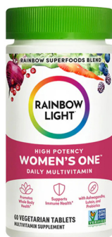
Rainbow Light High Potency Women's One Multivitamin