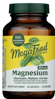
MegaFood Magnesium 300 mg